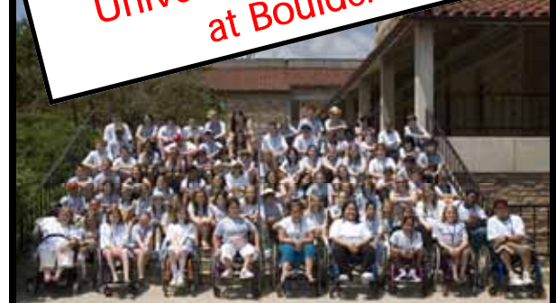
Youth Rally Campers University of Colorado—Boulder

July 11-16, 2009 University of Colorado at Boulder