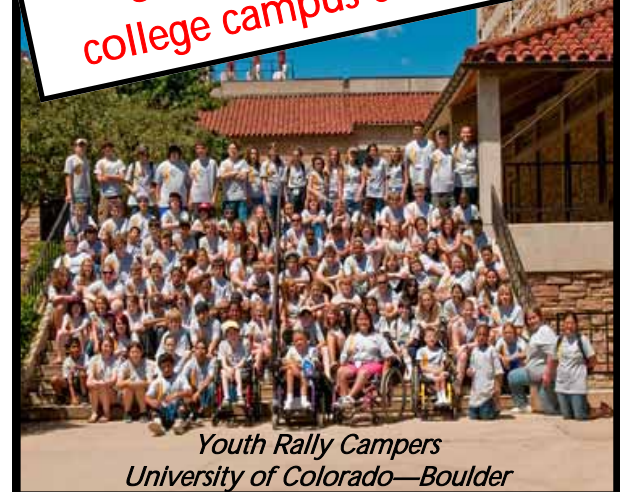
Youth Rally Campers University of Colorado—Boulder

6 days at a different college campus every July